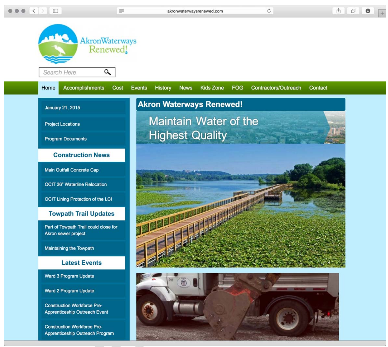
Figure 2-1 New City of Akron CSO Program Website