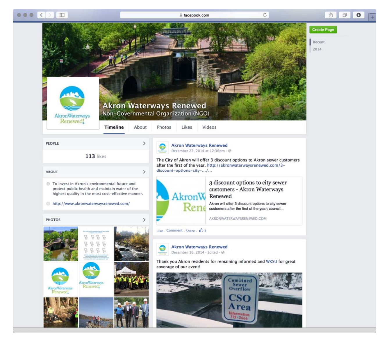
Figure 2-2 Akron Waterways Renewed Facebook page