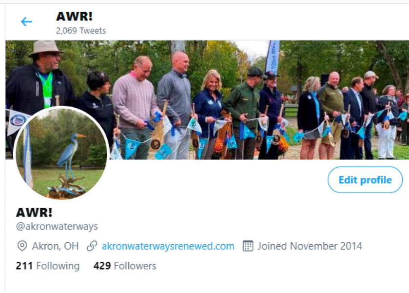
Figure 2-3 Akron Waterways Renewed Twitter Page