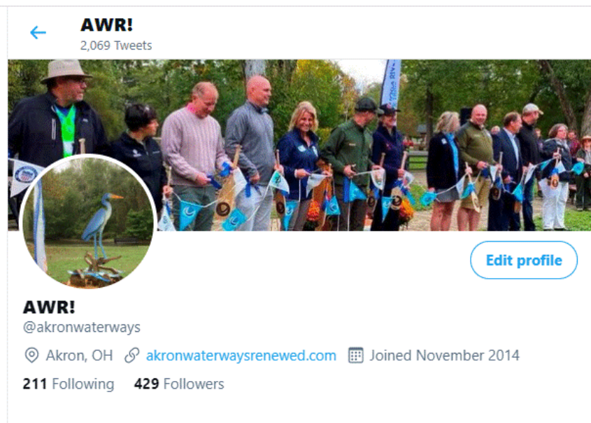
Figure 2-3 Akron Waterways Renewed Twitter Page